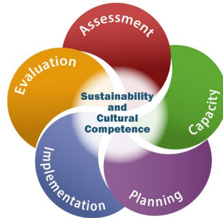
SAMHSA's Strategic Prevention Framework

The Strategic Prevention Framework model was adopted by the Drug Policy Board in 2005 to guide substance abuse prevention planning in the state.