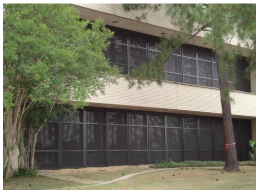
Retrofit of Facilities