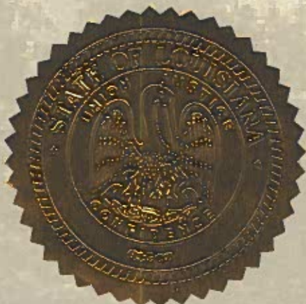
John Bel Edwards Governor

IN WITNESS WHEREOF, I have hereunto set my hand officially and caused to be affixed the Great Seal of the State of Louisiana, at the Capitol, in the City of Baton Rouge, on this 24th day of October A. D., 2021.